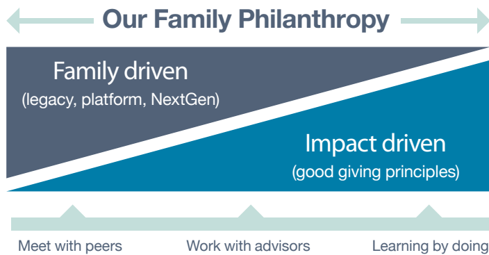
FIG. 1: Drivers for Family Business Philanthropy